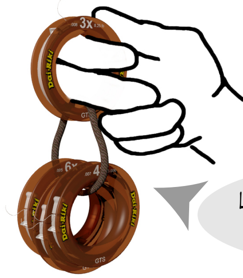
Modeled in Rhino Rendered in Flamingo Compiled in Photoshop

LOOSE SPOOLS ARE EASIER TO READ, COMPACT WHEN STOWED AND MORE POSITIVE TO GRASP.